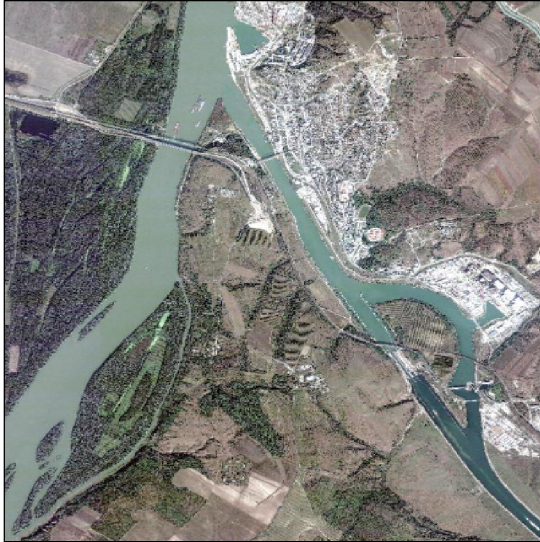
Fig. 1. Cernavoda NPP Site on Quickbird satellite image 05/10/2007

Black Sea. In the 1970s, a new dam raised the Danube's level and eased navigation through the Iron Gates. The river has become an important source of hydroelectric power and of irrigation water for farming. Romania's rivers are mainly tributaries of the Danube.